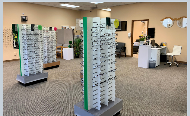
Evergreen Eyewear's new location 679 W Centennial Blvd, Springfield OR 97477

Evergreen Eyewear maintains more than 600 frames in stock including name brands such as Ray-Ban, Jimmy Crystal, Vera Wang, Adin Thomas, Nike, and many more. Additionally, we offer safety-rated frames including Wolverine and WileyX.